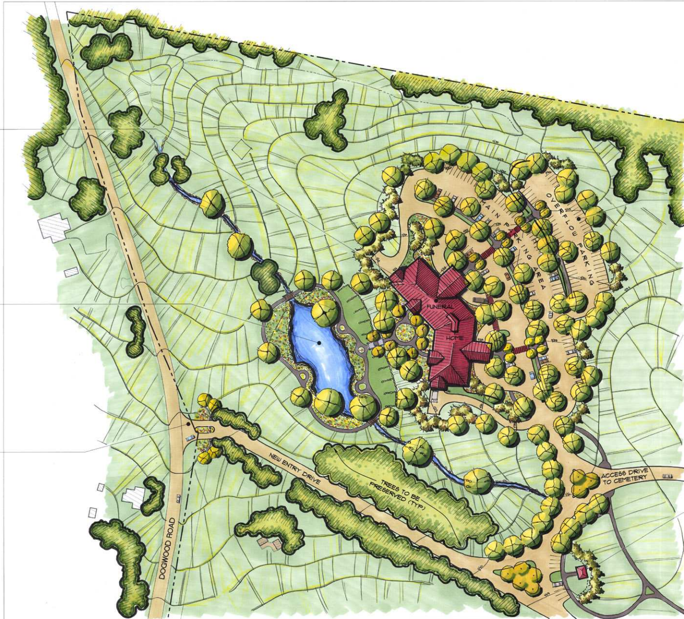
ENLARGEMENT A - FUNERAL HOME CONCEPT PLAN