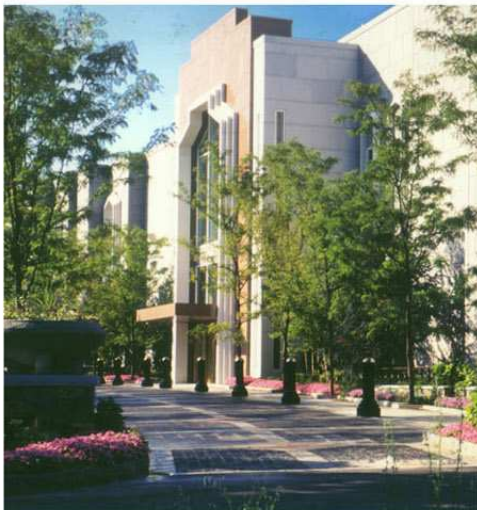
4. Final Illustration