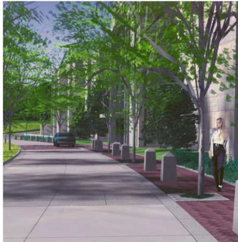
2. First Concept Simulation