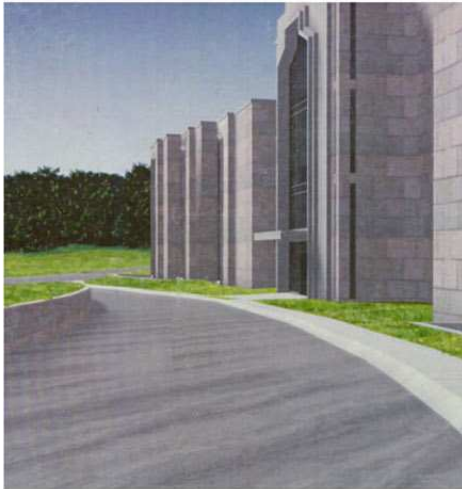
1. Original Architect Simulation