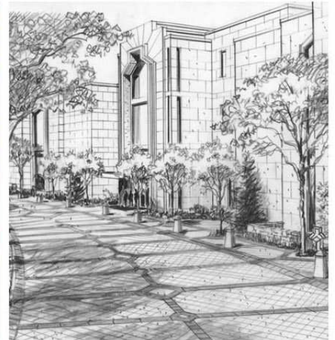
3. Second Sketch Study

A protracted approval process led to Landplan providing prime consulting services for the site planning, civil engineering, landscape architecture, and construction administration. An existing drive was transformed into a tree-lined granite promenade a forecourt sculpture remains garden.